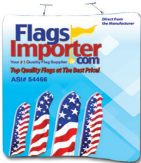
8FT CURVED BACKDROP