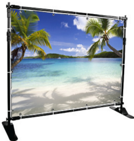
8X8FT STRAIGHT BACKDROP